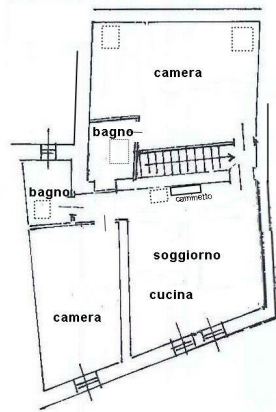
PIANO TERZO ipotesi di modifica